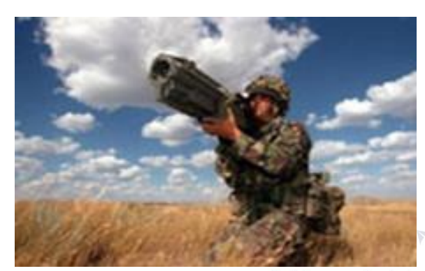
Building supply chains for the future

NDI is the leading supply chain sourcing and development service for the defence, appropriate space and security sectors.